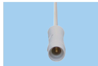
SC = 0.7 mm connector