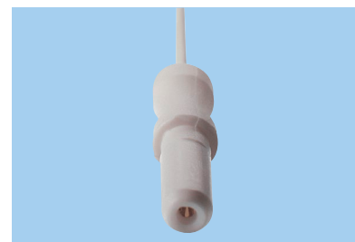
K = 1.5 mm connector

71005-K/C/12 ● Product ● Color kit ● Wire length ● Electrodes in pouch ● Connector